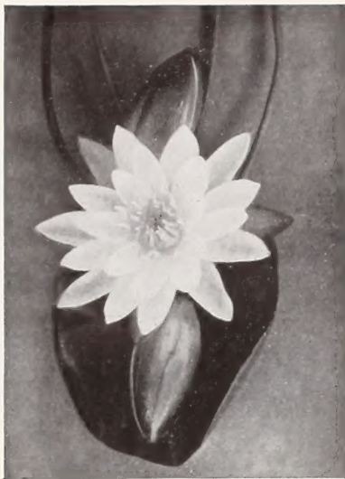
WHITE WATER LILY

FRAGRANT WHITE WATERLILY , Nymphaea odorata . Of easy culture in a sunny pool. Blooms in Summer.